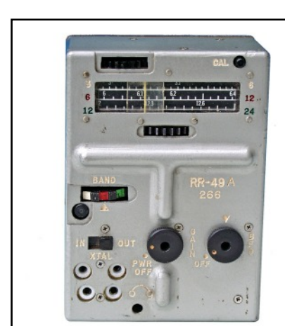
The CIA RR-49A was believed the parent set of the Latvian Seja.