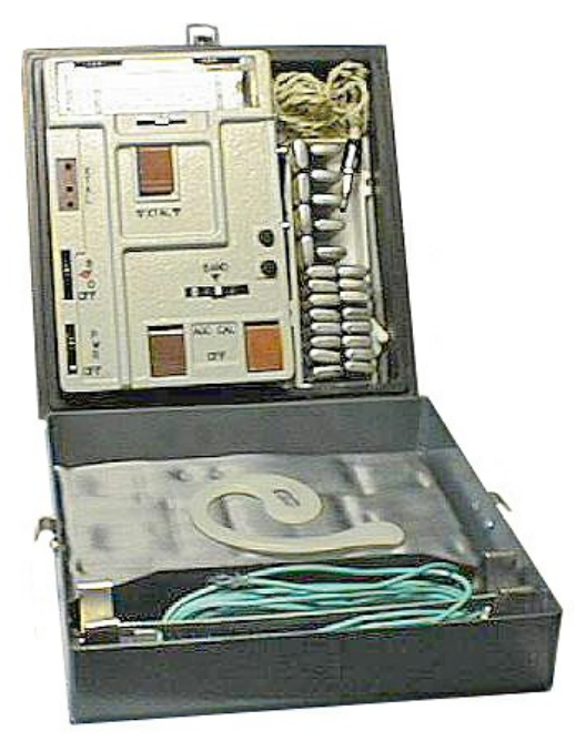
Seja with crystal box and accessories in container. It may be speculated that an associated transmitter was stowed in the empty space in the lower part of the container

The general appearance and features of the receiver were similar to the CIA RR-49A (see chapter 112) and it is believed to be developed after a close look at a captured RR-49A receiver. Further information is currently unknown.